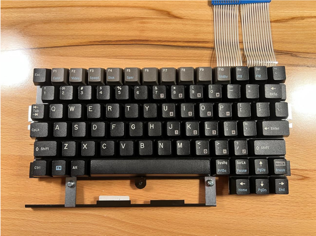
Grid 1550 US Keyboard